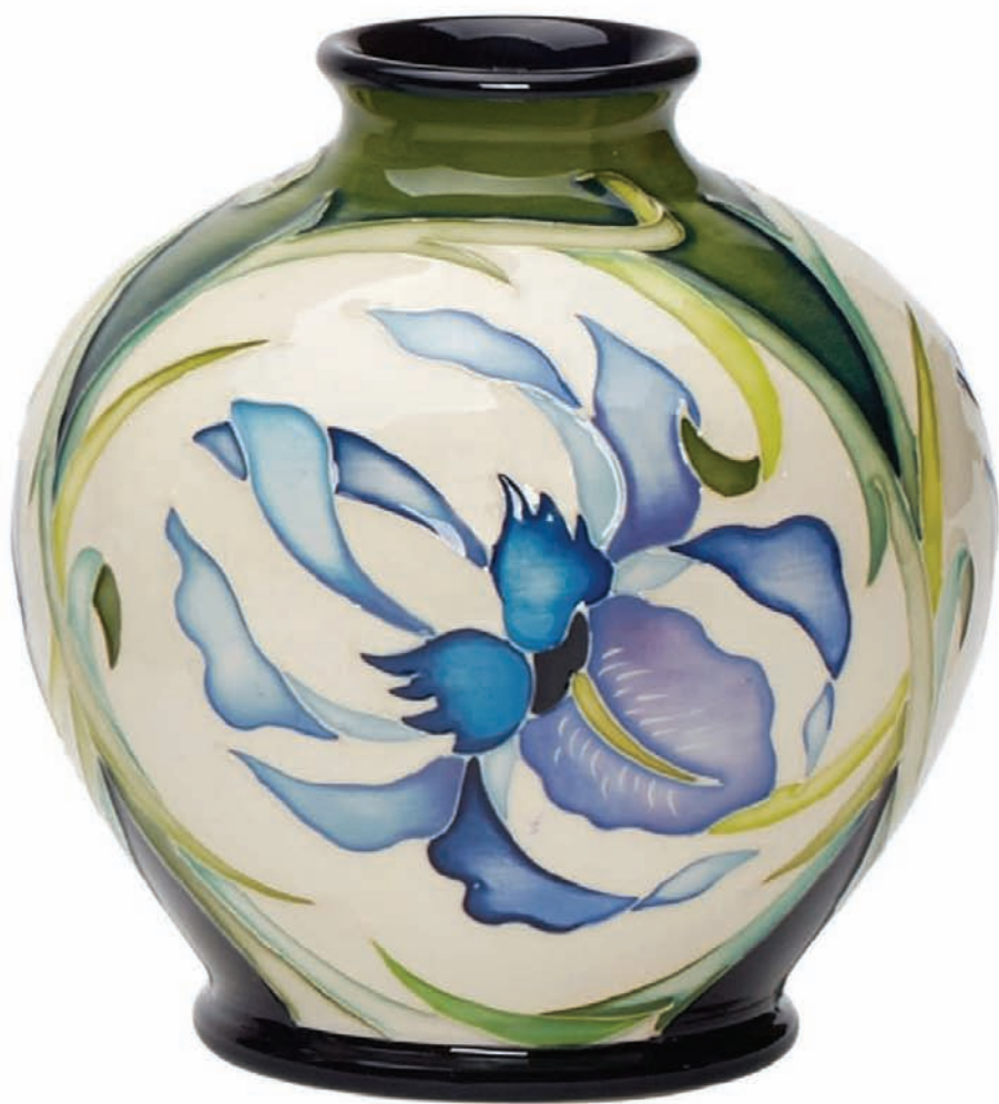
Another piece of pottery in the name of Lady Beatrix Stanley