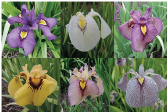
Iris pseudodata hybrids