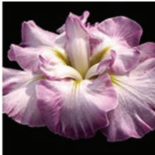
'Rings A Bell' (Bauer/Coble, '11)