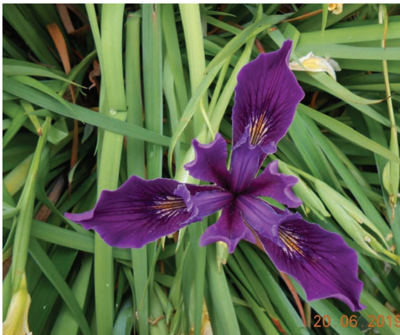
Seedlings from Iris 'Kinnoull'