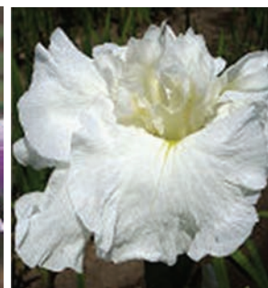
'Ruffled White Water'