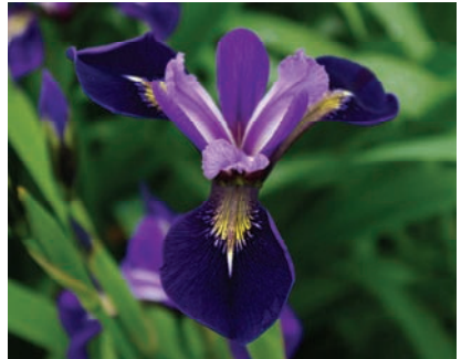
SPEC-X ‘Do The Math’