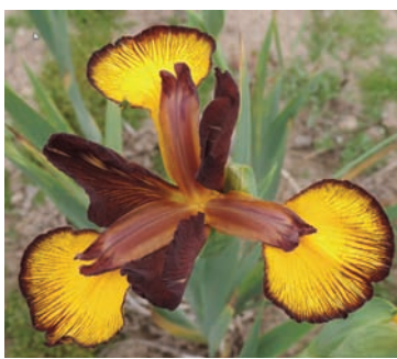
‘Falcon’s Crest’ (Jenkins, R. ‘89)

had more yellow radiating out from the centre of both the standards and falls and equally desirable.