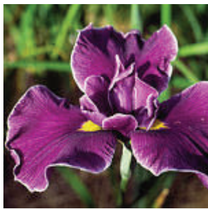
Japanese Pinwheel' (McEwen, '88)