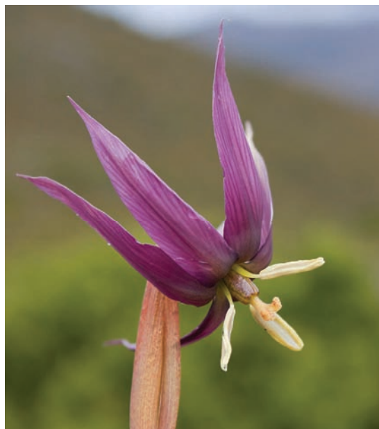
Isophysis tasmanica 'Mt Eliza', Tasmania

There is one characteristic which all the Iridaceae share and that is the ovary, where the seeds develop, is situated below the flower parts. Botanists refer to this as an inferior ovary, though nothing judgemental is implied. However, there is the exception of Isophysis tasmanica , with its superior ovary which is above the floral parts. How can such a profound anomaly not pique your curiosity? It certainly did mine and I wanted to know more.