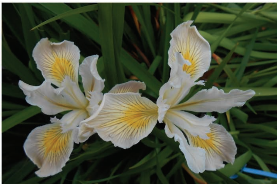
Two beautiful seedlings of Philips PCIs. Note the petal shape. And the space between the petals.