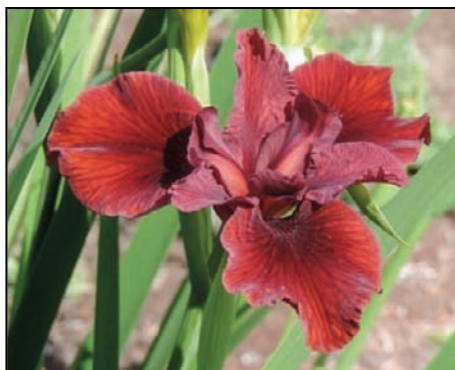
SPEC-X calisbe Iris ‘Rubicon’

Crossing into Washington State, lunch was arranged for us at the Vancouver Military Base now a National Historic Site. After lunch we drove to Aitken’s Salmon Creek Garden which nestled in a quiet residential area of Vancouver, WA. Terry and Barbara Aitken moved there in 1974. The garden covers a large area and was ablaze with colour from the iris blooms. Being one of the larger plots a greater proportion of the “guest” irises could be accommodated together with their own irises, still allowing plenty of space for viewing. Slowly bypassing the tall bearded irises that had been the focus of attention